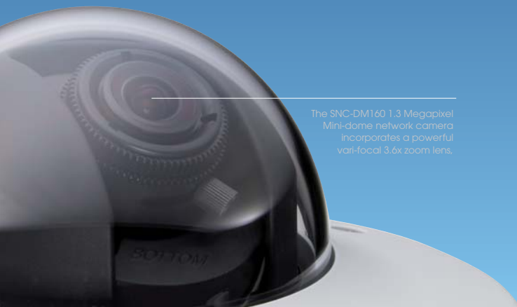
The SNC-DM160 1.3 Megapixel Mini-dome network camera incorporates a powerful vari-focal 3.6x zoom lens.