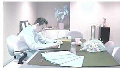
Conventional dual mode color / IR camera: Video taken without MFP technology suffers from IR bleed and poor quality color.