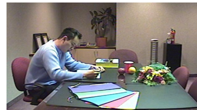
MFP Technology: The same scene shows excellent color performance under Extreme's mechanical filter technology.